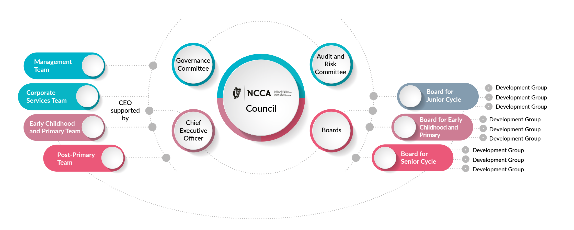
Figure 1: NCCA's structure