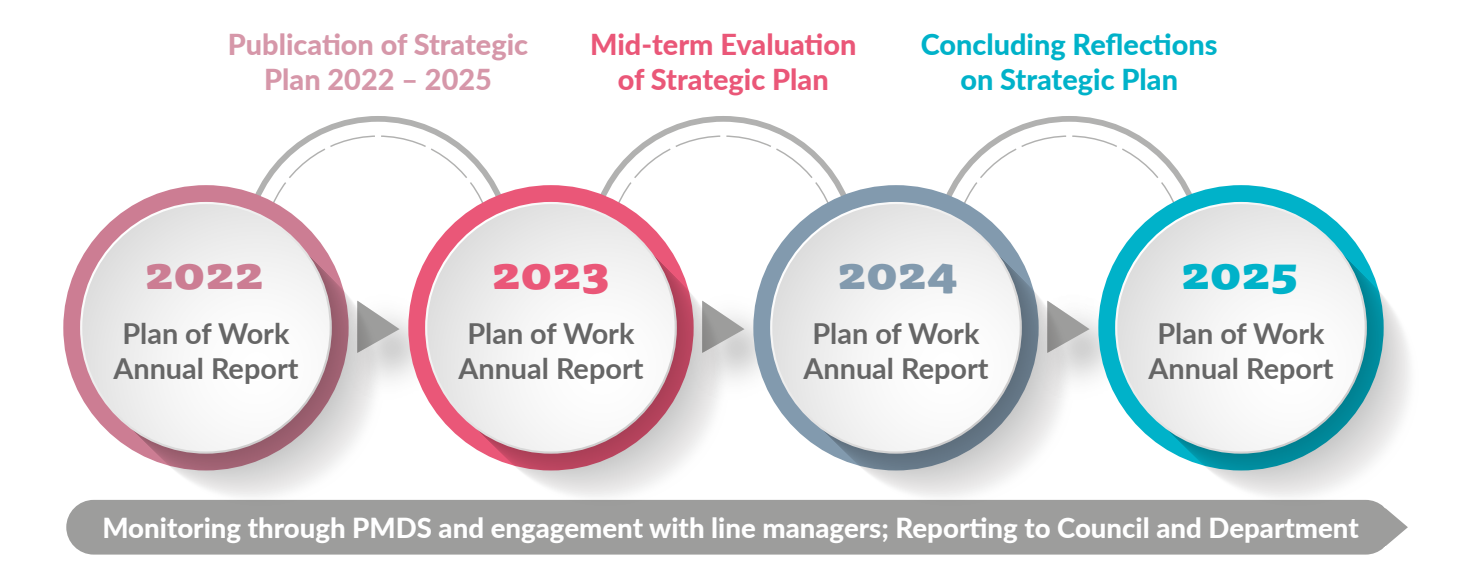
Figure 3: Monitoring and evaluating the strategy

NCCA's work is shaped by a wide range of policy and plans, such as the Programme for Government, the Department of Education Statement of Strategy 2021-2023 and annual Action Plans for Education, as well as evolving national priorities. This often requires NCCA to undertake new, unanticipated pieces of work. Furthermore, the unprecedented events of the last two years coupled with the pace of societal change reinforce the need for education systems to be agile and dynamic in responding to unforeseen challenges. This new strategy has been designed as a living, dynamic document to support Council in responding with agility to developments and issues that may arise in the next four years. This is facilitated through monitoring and evaluation which ensures transparency, provides rich and timely insights into ongoing implementation, contributes to effective decision-making and affords opportunities for more in-depth review (see Figure 3).