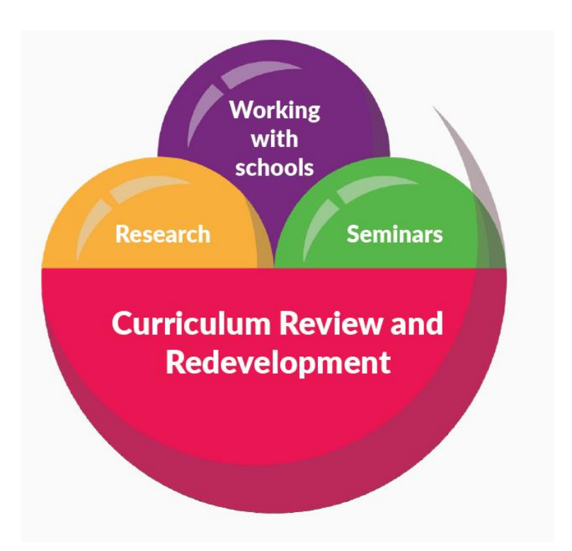
Figure 1: Three strands of curriculum review and redevelopment

The National Council for Curriculum and Assessment (NCCA) is reviewing and redeveloping the primary school curriculum. We are working with teachers and early childhood practitioners, school leaders, parents and children, management bodies, researchers, and other stakeholders to develop a high-quality curriculum for the next 10-15 years. We need to ensure that a future primary curriculum can continue to provide children with relevant and engaging experiences that contribute to their childhood and their later years as adults. Taking account of contextual considerations, the work involves a consideration of the purpose, structure and content of a redeveloped primary curriculum. There are three complementary strands to this work: 1) Working with schools, (2) Research and (3) Seminars (see Figure 1). Each strand feeds into and helps shape the others and equally, each is informed by the others.