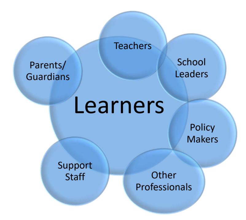
Figure 3. Various groups of stakeholders for whom assessment provides information

A third and final concept that may help provide clarity is <u>that assessment provides</u> information for various groups of stakeholders in the primary education system, and that the central group of stakeholders are the learners. Learners require information that allows them to identify where they are in terms of their learning, and what they need to do to progress beyond that point. <u>Other groups of stakeholders that require information from</u> assessments include teachers, support staff, parents/guardians, school leaders, policymakers and other professionals ( e.g. NEPs psychologists, therapists). These stakeholders require information not for themselves, but in order to make decisions which will ultimately impact on the learners <sup>5</sup> (see Figure 3).